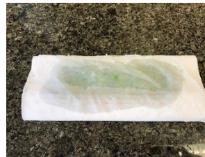
Wrap frozen peas in damp paper towel