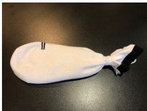
Raw rice in an 80% cotton sock with end tied off

If your eye(s) become irritated or red, you may use over the counter artificial tear drops for comfort as much as you like. We suggest Retaine®, Systane®, Refresh® brands, or any preservative free lubricating eye drops. For more specific tear supplement information, visit our website www.plasticeyesurgery.com .