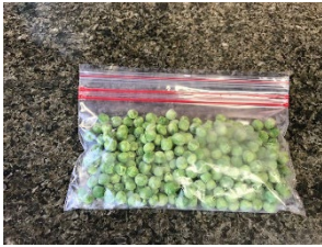
Partially filled frozen peas in a snack-size bag

After 48 hours of cold compresses, switch to warm compresses until all the bruising is gone.