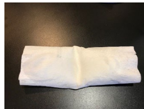
Wrap the sock in damp paper towel

IMPORTANT NOTE: It is normal for swelling and bruising to worsen for the first two to three days, especially in the mornings. DO NOT BE ALARMED.