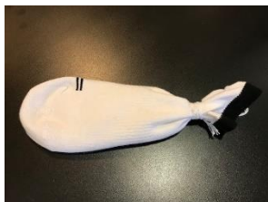
Raw rice in an 80% cotton sock with end tied off

Caution: Rice at the center of the sock may get hotter than that at the periphery during microwave, so shake the sock well before testing the temperature.