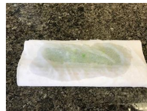
Wrap frozen peas in damp cloth or paper towel