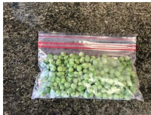
Partially filled Frozen peas in a snack size Ziplock bag

Frozen green peas in a snack size bag over a DAMP paper towel make a great cold compress. For best effect, keep the compress on constantly, but change the bags of peas every 20 -30 minutes as the peas warm up. For application to both eyes, 6 - 8 snack size bags of peas are usually sufficient to rotate through the freezer. Ice cubes or ice chips can be used over a thick damp facecloth, but we caution to avoid frost bite. The compresses should be comfortably cool, not “freezing cold”. A damp cloth helps to transmit the cold temperature more effectively. In general, cold compresses are applied for the first 48 hours only, to cause blood vessels to spasm, decreasing the degree of swelling.