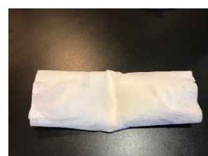
Wrap the sock in damp face cloth/paper towel