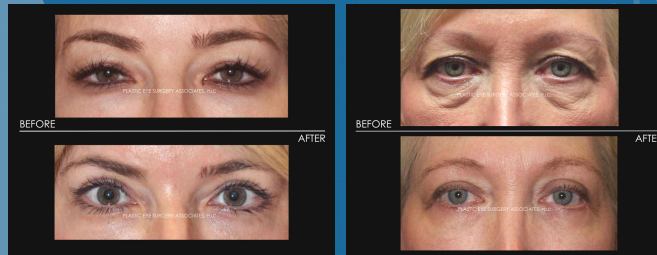
Upper Eyelid Blepharoplasty with Droopy Eyelid Repair