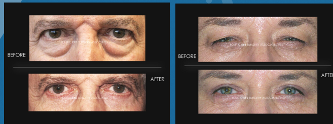
Upper and Lower Eyelid Blepharoplasty